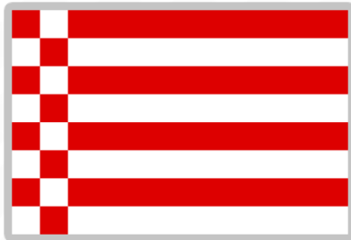
Shelter International e.V.