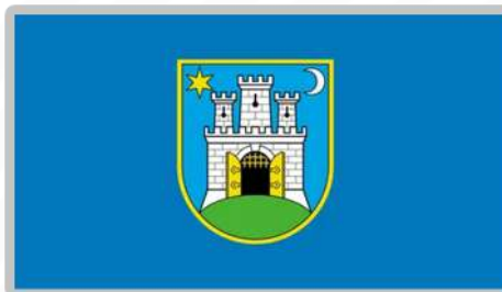
Youth Organisation Veles