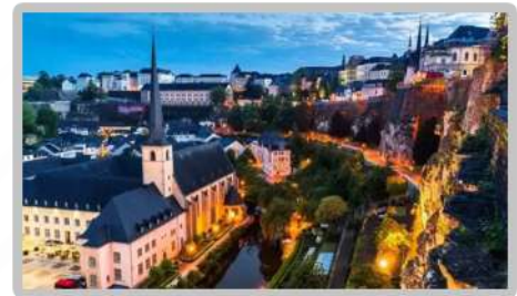
United We Stand Luxembourg