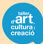
Taller d'Art, Cultura i Creació (Spain)