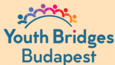
Hidak Ifjúsági Alapítvány (Hungary)