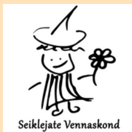
Seiklejate Vennaskond (Estonia)