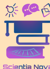
Association Scientia Nova Kavadarci (North Macedonia)